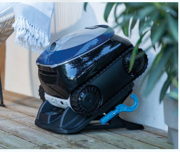
Practical inducitve docking and charging station